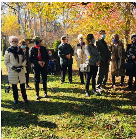
2021 Member's Memorial ceremony